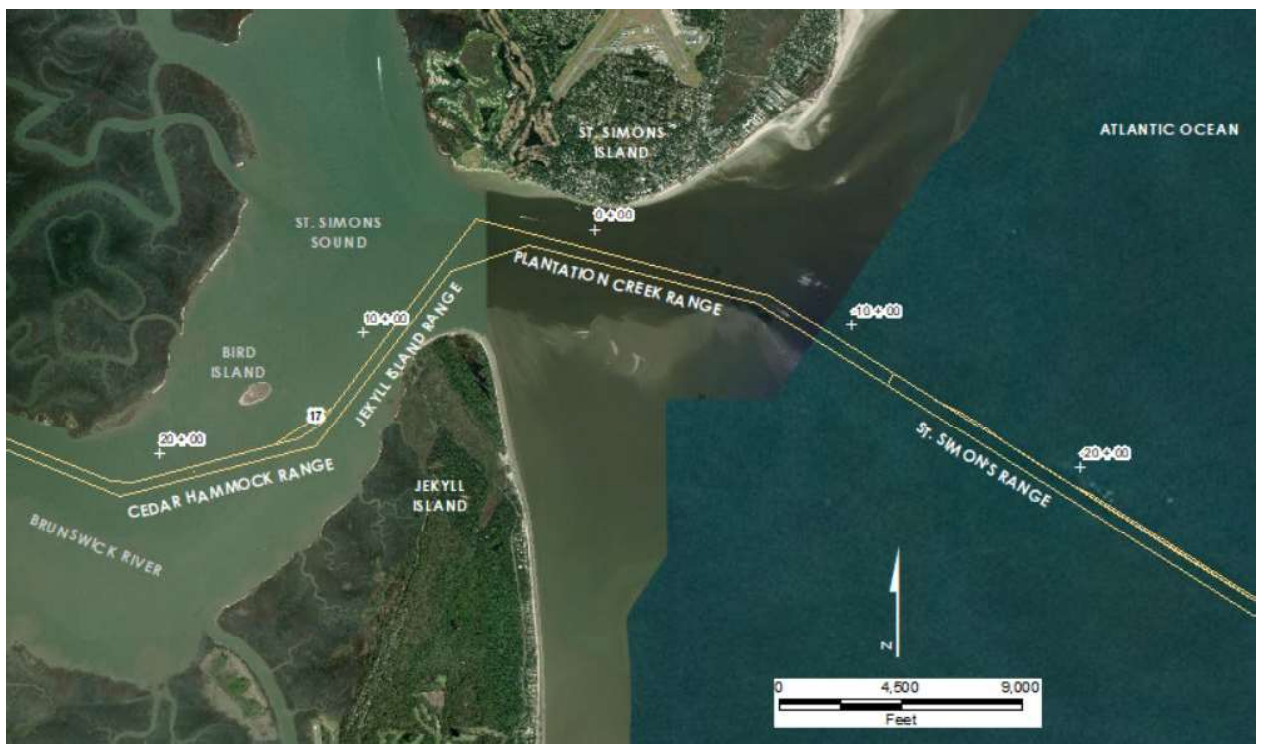
Figure 2 - Brunswick Harbor Existing Entrance Channel Configuration