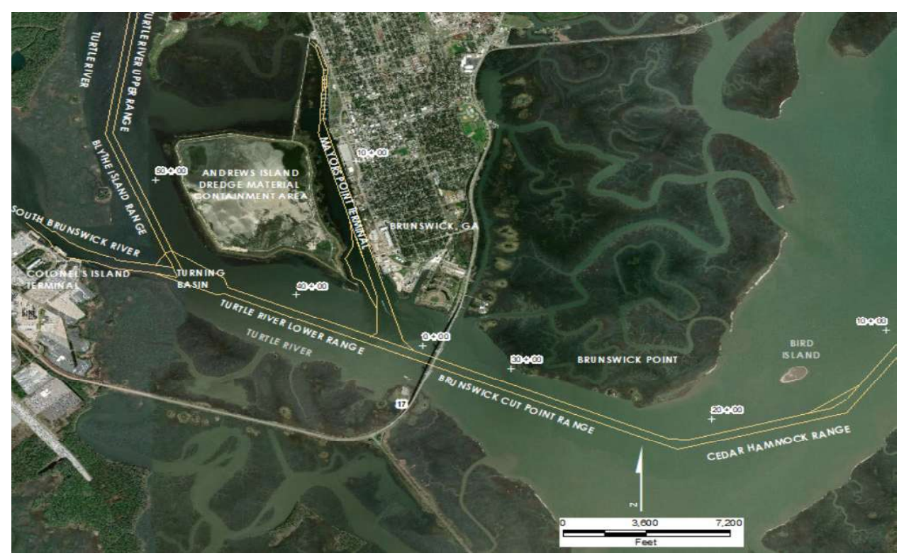
Figure 3 - Brunswick Harbor Existing Inner Harbor Channel Configuration