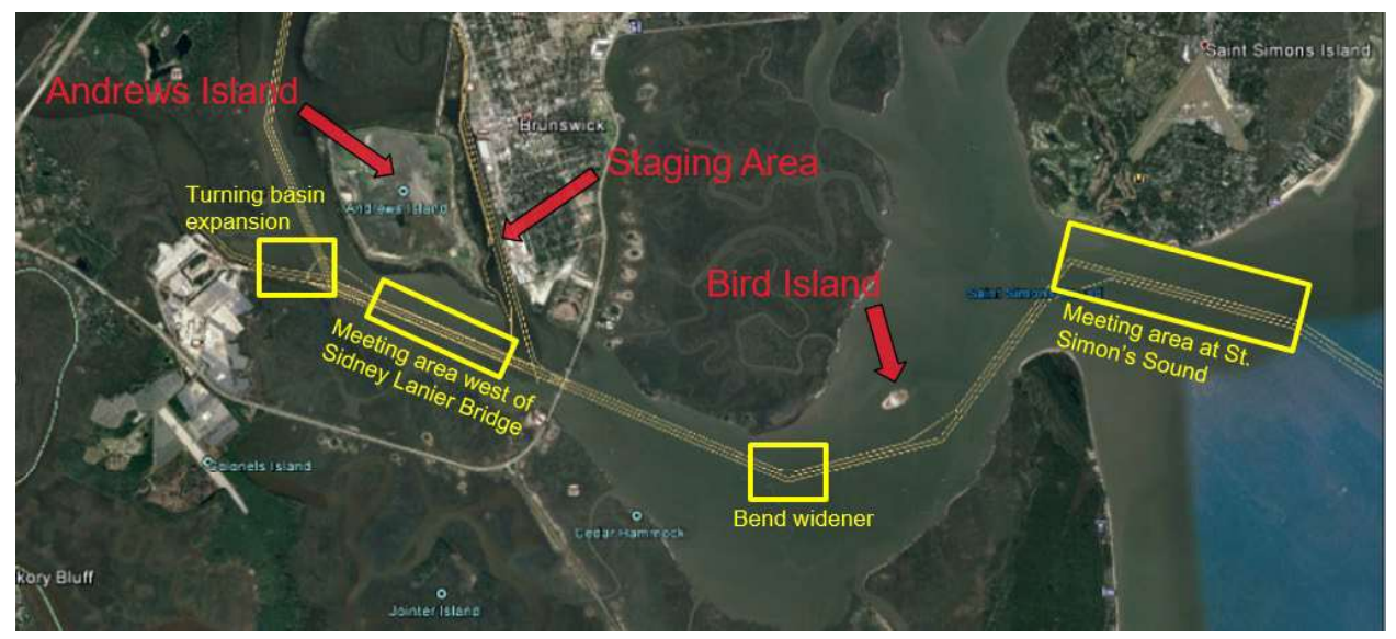
Figure 7 - Brunswick Harbor Staging Area and Andrews Island Disposal Area